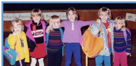
Individuals with Disabilities Education Act, 2004, Part A

Disability is a natural part of the human experience and in no way diminishes the right of the individual to participate in or contribute to society.